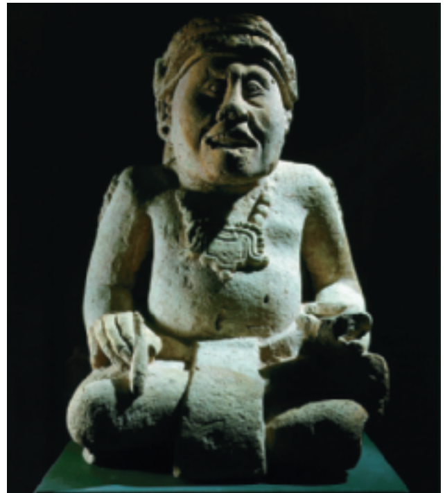
MAYAN MONKEY-MAN SCRIBAL GOD The Mayas believed in hundreds of different gods, and they attempted to personify many of them in sculptures such as the one depicted here, which dates from before 900 A.D. The monkey gods were twins who took the form of monkeys after being lured into a tree from which they could not descend. According to legend, they abandoned their loincloths, which then became tails, which they then used to move more effectively up and down trees. The monkey-men were the patrons of writing, dancing, and art.

Eskimos of the Arctic Circle fished and hunted seals; their civilization spanned thousands of miles of largely frozen land, which they traversed by dogsled. The