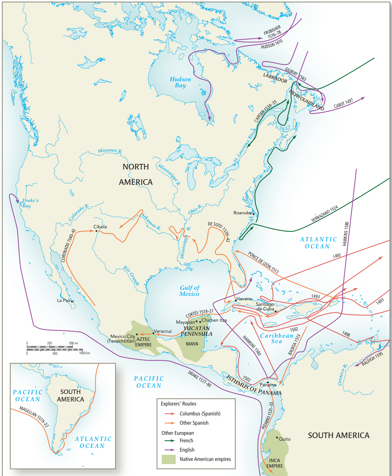
EUROPEAN EXPLORATION AND CONQUEST, 1492–1583 This map shows the many voyages of exploration to and conquest of North America launched by Europeans in the late fifteenth and sixteenth centuries. Note how Columbus and the Spanish explorers who followed him tended to move quickly into the lands of Mexico, the Caribbean, and Central and South America, while the English and French explored the northern territories of North America. ♦ What factors might have led these various nations to explore and colonize these different areas of the New World?

For an interactive version of this map, go to www.mhhe.com/brinkley13ech1maps