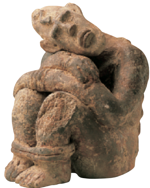
SCULPTURE OF DJENNÉ Many of the Africans forcibly exported from their homes to America in the seventeenth and eighteenth centuries were natives of Mali, the seat of an ancient east African civilization. This terra cotta sculpture, discovered in the 1940s, dates from between 600 and 900 years ago. It may be an image of an ancestor created for use in a family shrine. ("Seated Prisoner," 11th/16th Century, Djenne, Founders Society Purchase, Robert H. Tannabill Foundation Fund.)