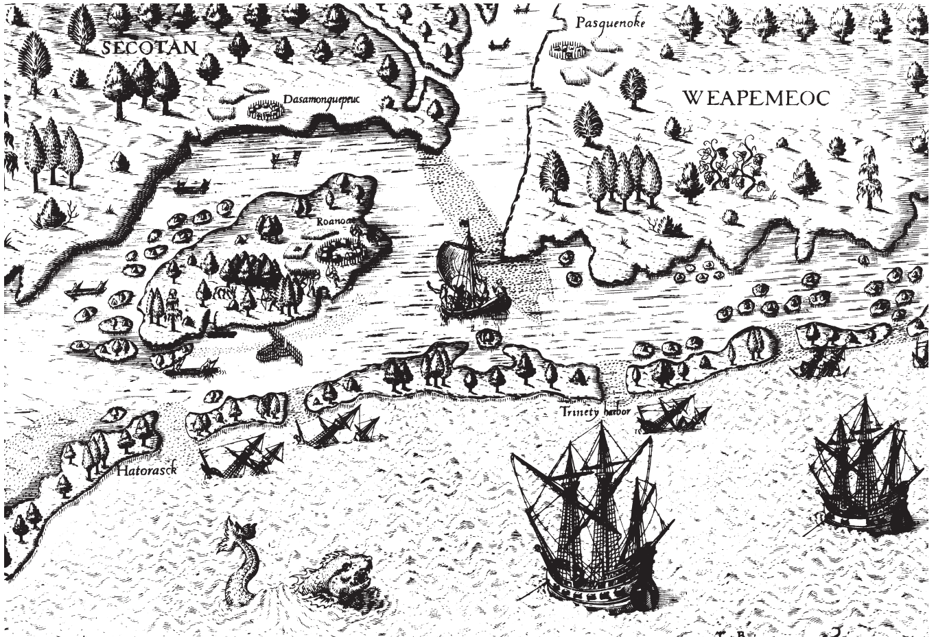
ROANOKE A drawing by one of the English colonists in the ill-fated Roanoke expedition of 1585 became the basis for this engraving by Theodore DeBry, published in England in 1590. A small European ship carrying settlers approaches the island of Roanoke, at left. The wreckage of several larger vessels farther out to sea and the presence of Indian settlements on the mainland and on Roanoke itself suggest some of the perils the settlers encountered.

itary outpost that might eventually grow into a profitable colony. But a storm sank his ship, and he was lost at sea.